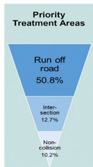
Great Southern Priority Treatments 2

A reactive approach to road safety refers to tools and strategies that rely on a crash occurring. Proactive tools and approaches are based on knowledge about the road and roadside factors that contribute to the risk. Proactive tools and approaches are important, as they are able to identify locations where there is a high risk of severe crash before it occurs.