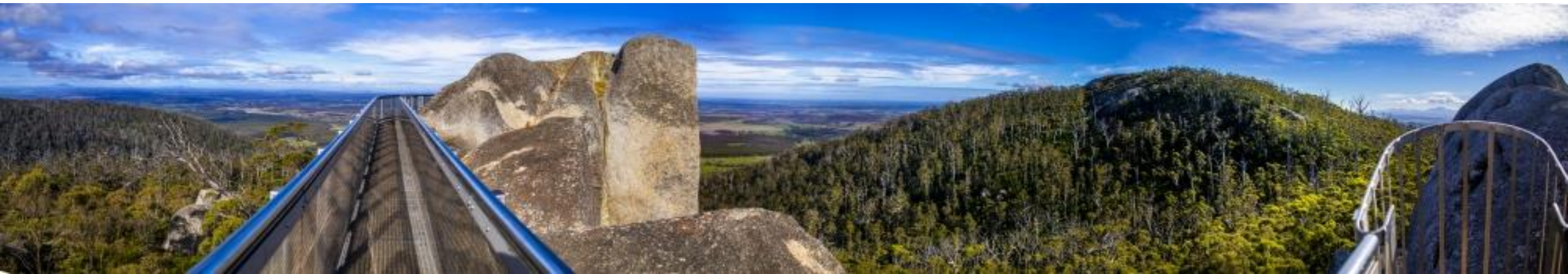
Image: Castle Rock Sky Walk, Porongorup National Park