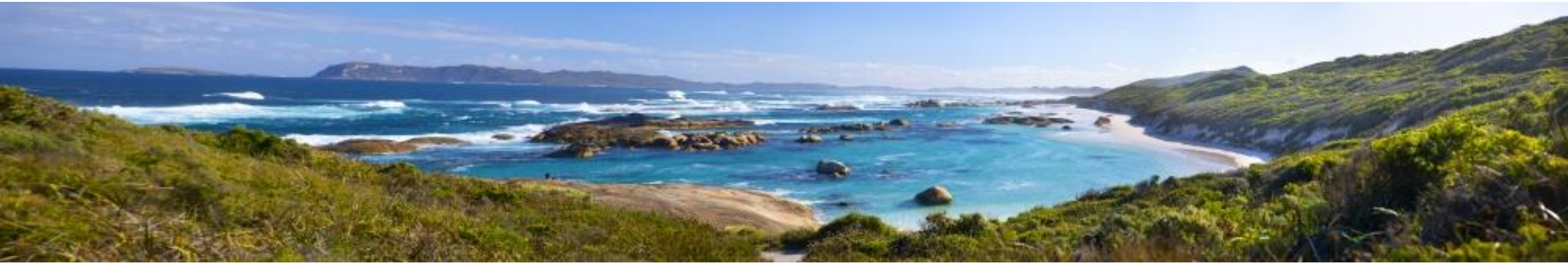
Image: Greens Pool, Denmark